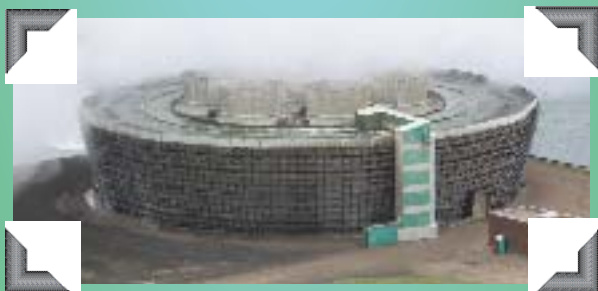
The giant cooling tower