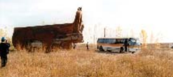
Our tour bus parked next to a giant shovel, can you believe how big it is?