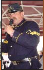
And at the end of our interesting day, a riverboat dinner cruise, complete with authentic host.

3-Day Coal Creek Tour $190 per person/ ($260 per couple, double occupancy) includes two-night accommodations at the Ramkota Bismarck Round-trip bus transportation Refreshments during the bus ride Lunch on tour day and riverboat cruise and dinner Please call 1-800-254-7944 for the next available tour date.