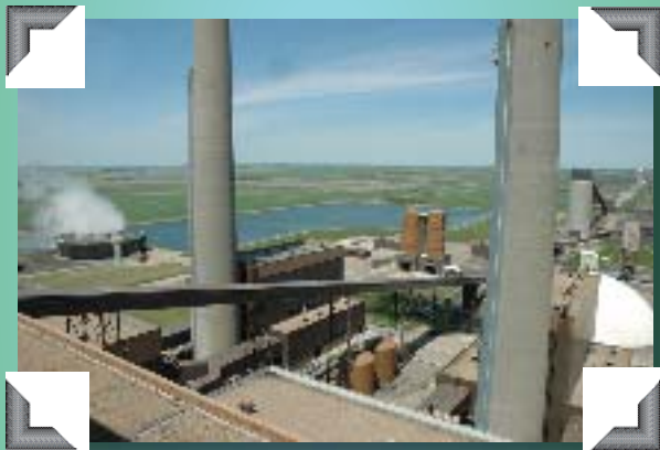
The view from the roof is awesome.