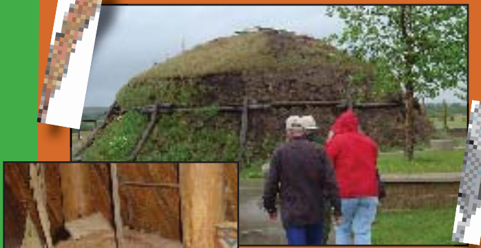
We stopped at the Lewis and Clark Interpretive center. Above, a sod hut. Inside the hut, we saw and heard how Native Americans lived.