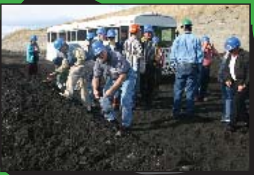
Our group does some coal mining