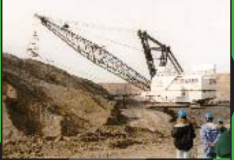
The shovel at work