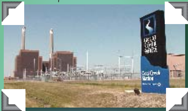
Coal Creek Station power plant

At Coal Creek station we saw where our power is made.