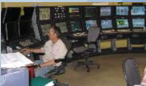
The control room