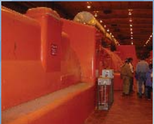
We walked along side the giant turbines that make the electricity