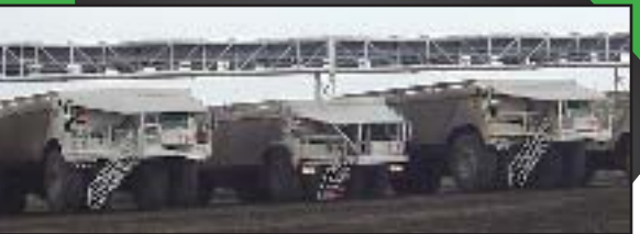
Giant coal trucks